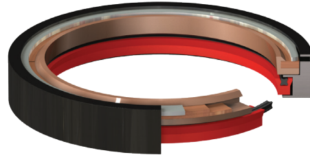
An A-Series, Style-3 Metallic Scraper. Dual C-springs are used on sizes <1.5" I.D.